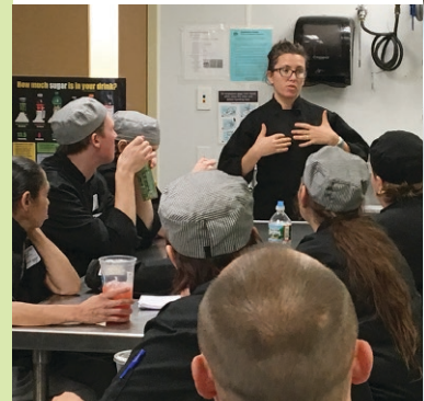
FY2019 Annual Impacts