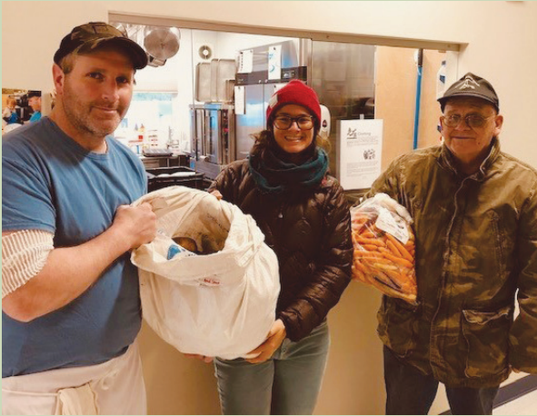
◀ Community partners are invaluable. Salvation Farms donates produce to our kitchen and for families.

In January of 2018 we opened our Lamoille County Integrated Services Center in Morrisville. For the first time, all of our wrap around services are accessible in one location. This includes our Early Learning Center with three Head Start classrooms for 3-to-5 year olds providing critical early child development and education.