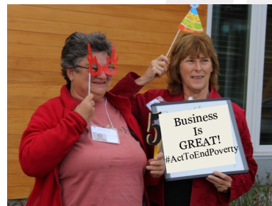
Top: Participants and community partners join staff at Capstone's Morrisville office for a 50th Anniversary open house.